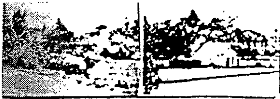
No. 57 Pavilior., Buninyong Botanic Gardens.

Land was first reserved for the Buninyong Bowling Club in 1872, and this Gothic Style Pavilion was probably erected shortly after this date. The simple rectangular plan and entry is defined with a gable roof. Although now in a deteriorated condition, this building is an important structure in the Gardens and should be maintained and enhanced.