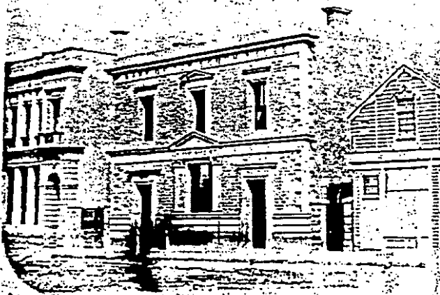
First premises, built 1857, demolished 1862.

The building represents a bank facade in a restrained, finely detailed classical manner. It forms part of a group of four banks designed by Leonard Terry which form an important unique corner streetscape element to the Sturt Street/Lydiard Street precincts. It is in good condition and is intact externally, visually marred only by the illuminated sign. The original stone and cement render finishes fortunately survive and should be retained in this state.