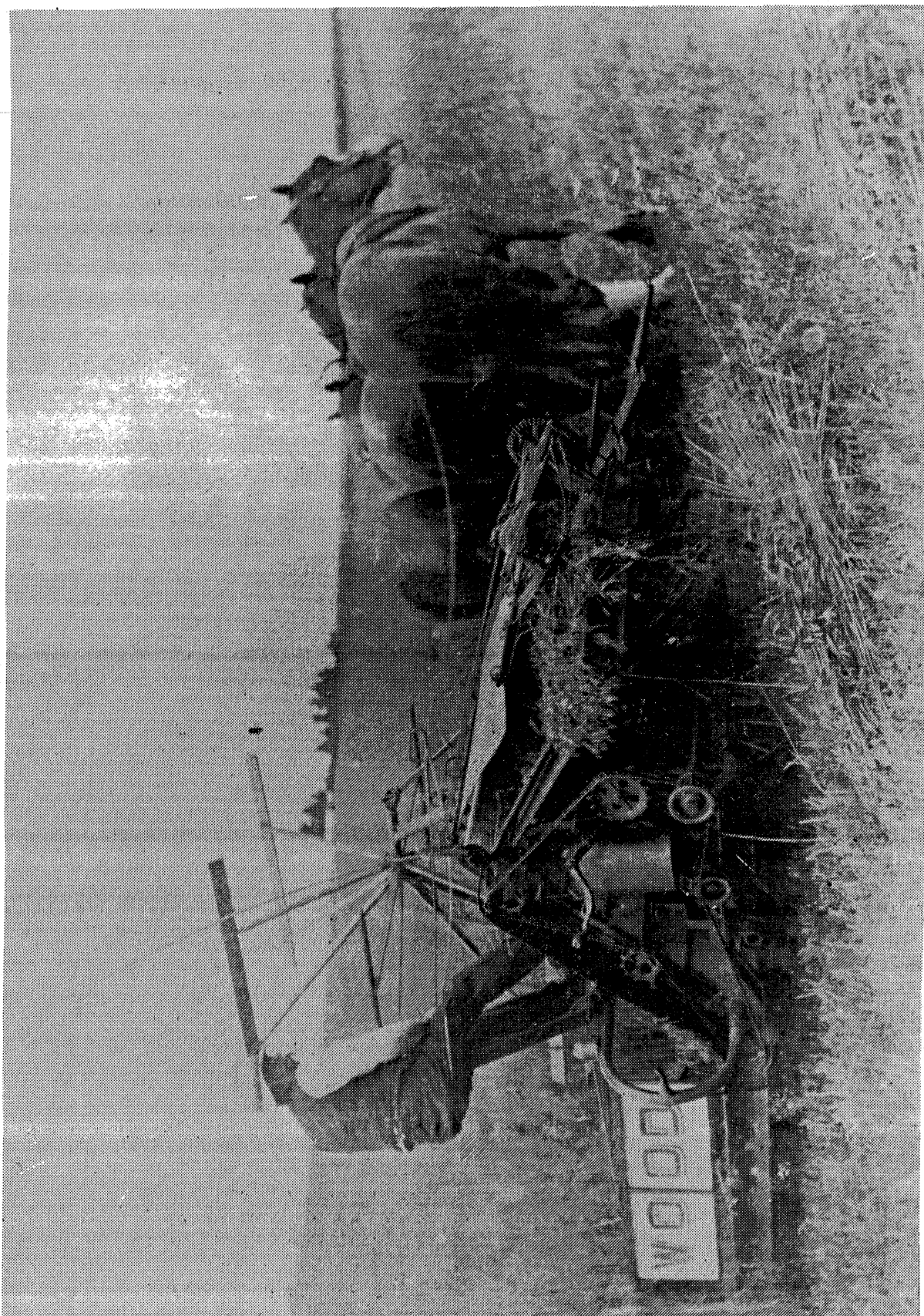
JAMES NESS HARVESTING OATS AT GARDEN HILL (ELHPC NO. 421)